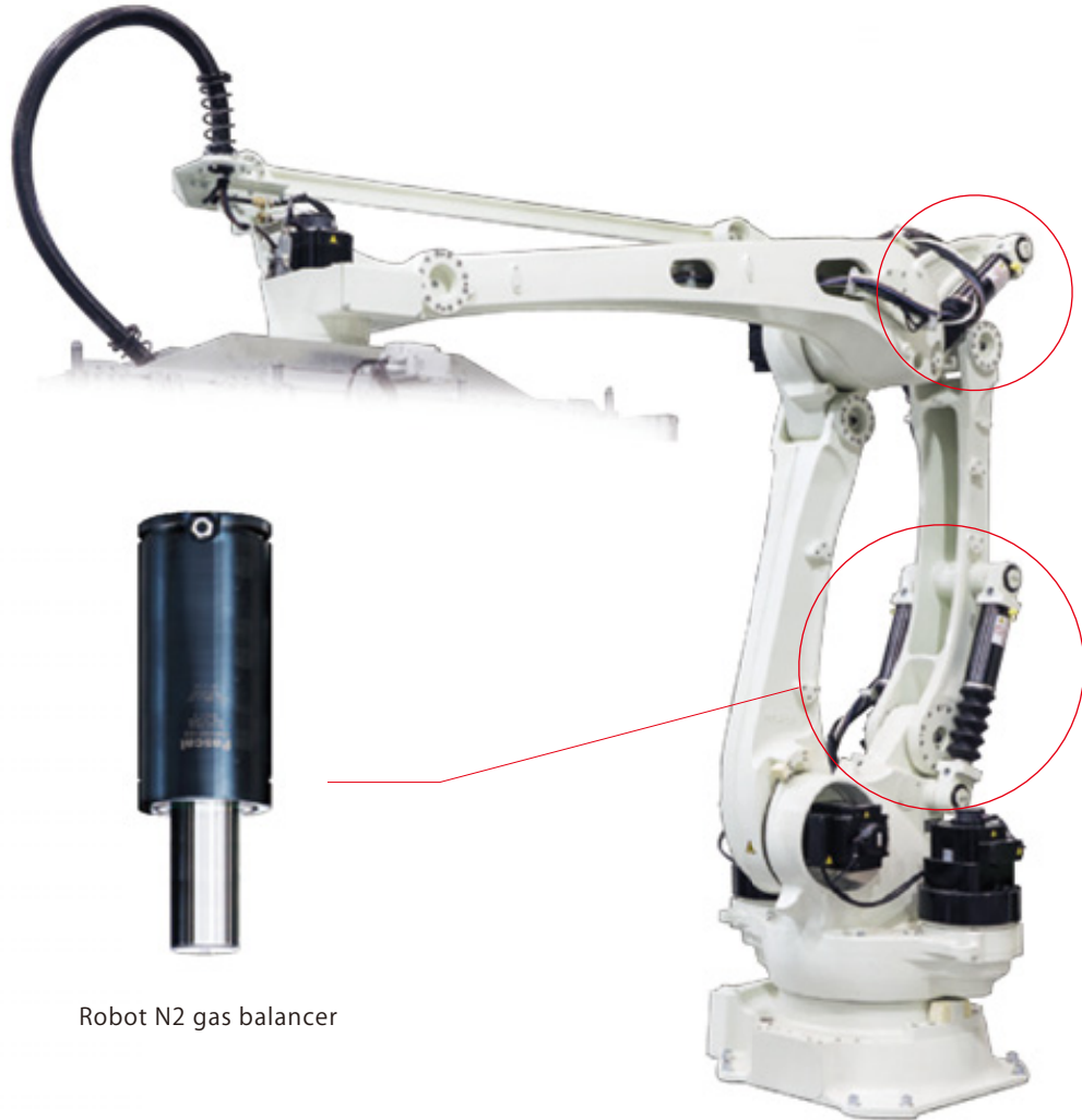
Robot N 2 gas balancer

Weight reduction, High speed, Downsizing of robot