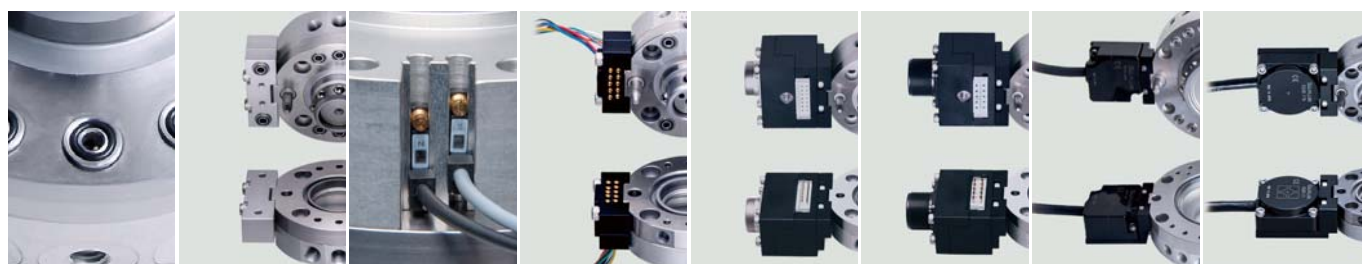
Connector for air Check valve model