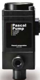
Pascal pump model X63